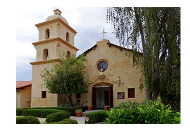
OJAI LEADS SOUTHERN CALIFORNIA WITH FIRST ALL-ELECTRIC REACH CODE

In late October, BayREN debuted its new Bay Area Energy Atlas, a counterpart to the existing Energy Atlas in operation at UCLA for the past several years. This tool, developed for BayREN by the California Center for Sustainable Communities at UCLA, offers a resource to assist local governments with climate action planning and to delve into how energy is being used in their jurisdictions.